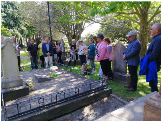
Descendants of the Matangi family gather around the grave of their ancestors on 30 November 2019